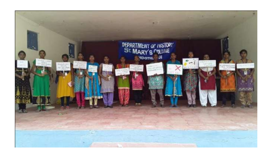
Plastic Awareness Programme at Tharuvaikulam