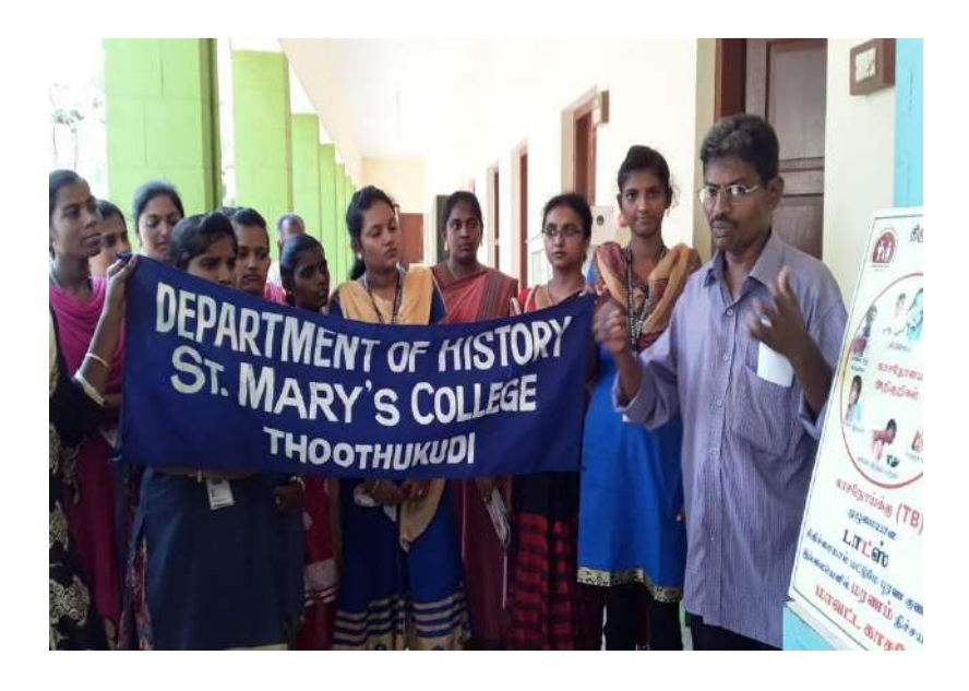
St. Joseph Leprosy Hospital, Arokiapuram, Thoothukudi