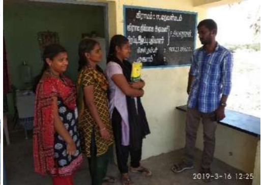
Department of Mathematics (SSC)

The community development programme was inaugurated on 29<sup>th</sup> Sep 2018. The staffs and the students of II B.Sc Mathematics arranged a programme on AWARENESS OF POSTAL BANKING with the help of the postal department of THOOTHUKUDI and with the support of the village people and the Parish Priest of Palayakayal. The programme started with the prayer song, welcome address and awareness song on saving and a detailed talk on the schemes of the postal banking and the meeting came to an end with the vote of thanks.