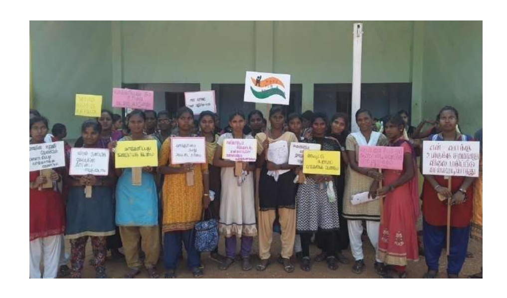
Voting Rights Awareness Placard Campaign