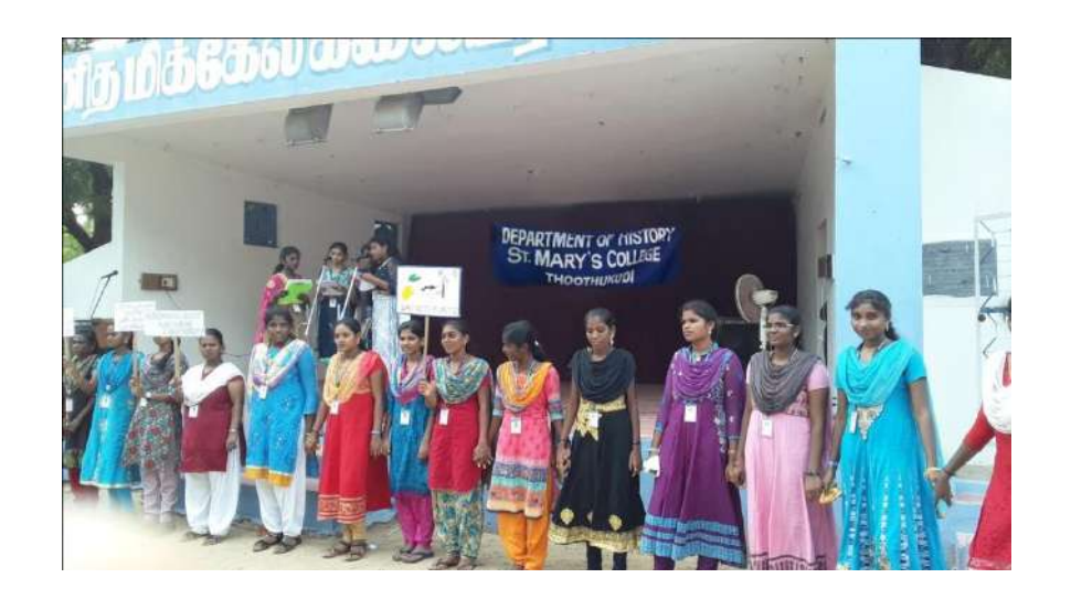
Human Chain - 'Say No to Plastics'